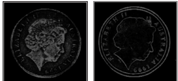
An IDBA-QC360 Bar Light (left) illuminates a coin from above and below (above left) and from left and right (above right).