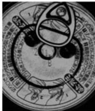
The IFH Thin Type Dome Eliminates Shadows and Reflections on the Shiny and Dimpled Surface of this Pop-Top Can